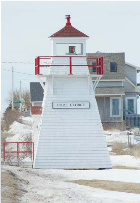
Lighthouse found in Port George.