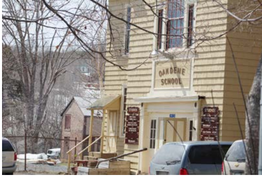
Oakdene School in Bear River.